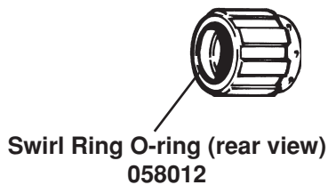
Swirl Ring O-ring (rear view) 058012