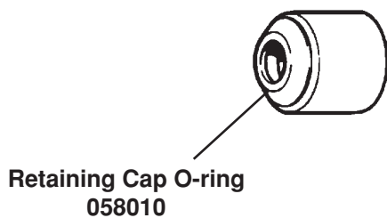
Retaining Cap O-ring 058010